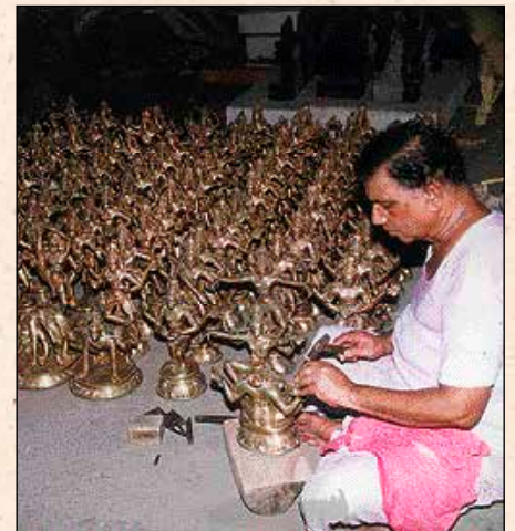
Sculptor: Craftsman completes 108 bronzes of Siva's Cosmic Dance for Gurudeva