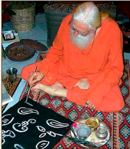
Sacred art: Gurudeva paints traditional Hindu symbols using wet vibhuti, holy ash