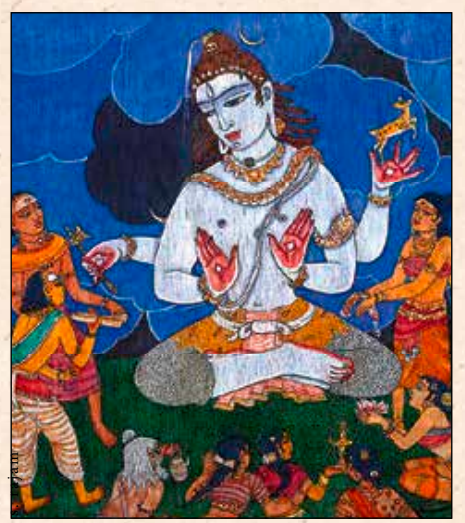
Grace: Devotees approach Siva. Gurudeva breathed new life into art and artists.