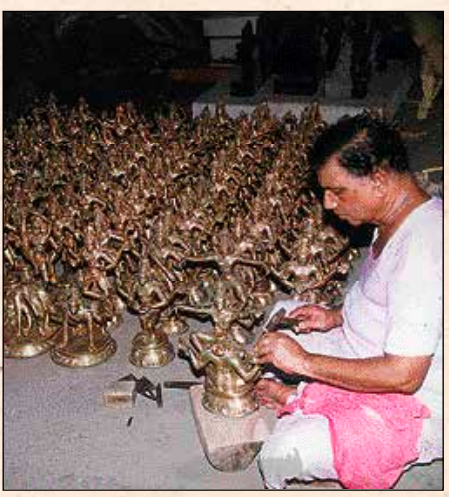
Sculptor: Craftsman completes 108 bronzes of Siva's Cosmic Dance for Gurudeva