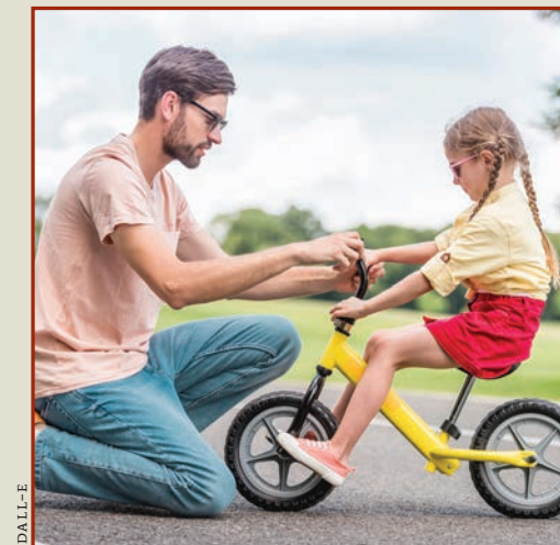
This girl was acting out in the family, refusing to follow even the simple rules and distancing herself from her mom and dad. They tried everything, from time-outs to yelling, but nothing worked. So they changed the approach and stopped correcting her so often. Instead they started a program of training her, with the family chores, even how to ride her new bike. It worked! She felt competent and cared for.