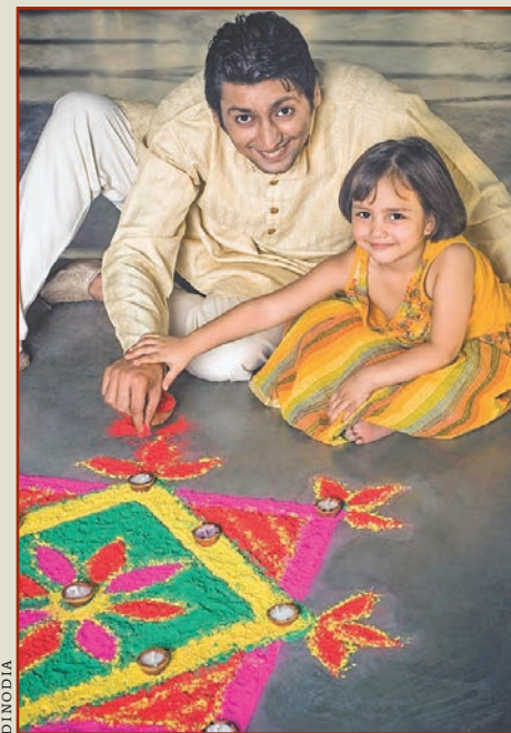
A father in Mumbai creates a rangoli design with his daughter on Dipavali. By having fun with her, he builds a relationship of trust, affection and cooperation.

Plan the special time with your children. Up to age 6, it can be daily. From 6 to 12, it can be more occasional, even weekly. Brainstorm ahead of time a list of things you would like to do together then.