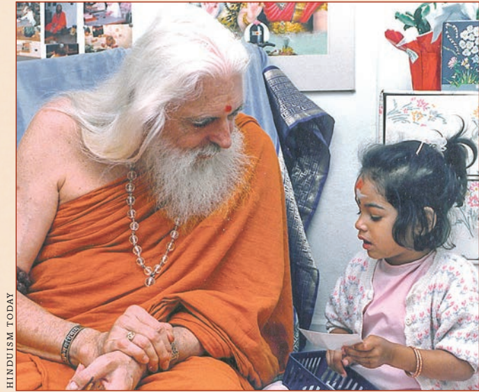
By listening we give children a sense of belonging and acceptance, as this little girl found out while sharing her business plan with Gurudeva

We hope this Insight will inspire readers to delve into a full study and adoption of Positive