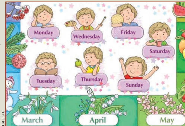
Routine charts can be simple to-do lists or elaborate calendars that include family chores, outings, grandma visits and more. They give structure that makes young ones feel competent and independent.

on the clock reached the 8, she could start following the chart. It was so much fun that she actually looked forward to getting ready for bed. By the time the newness wore off and she was no longer impressed by the chart, she had developed a strong routine and bedtime was no longer a hassle.