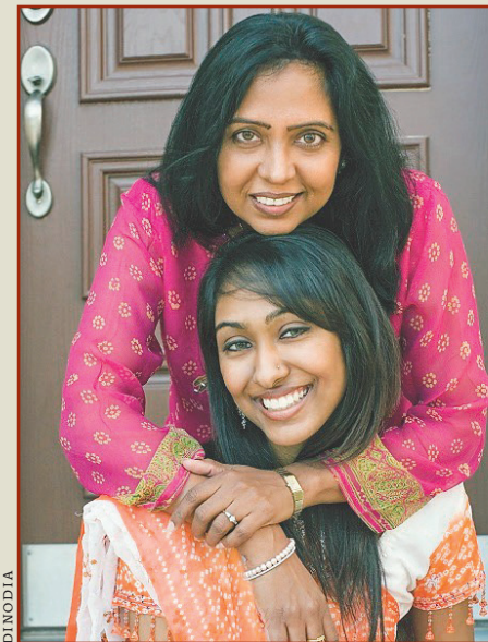
Asking the right questions about a sensitive issue can bring mother and daughter closer together. It is good to remember that a child's relationship with the parents can profoundly affect his or her decision-making patterns.