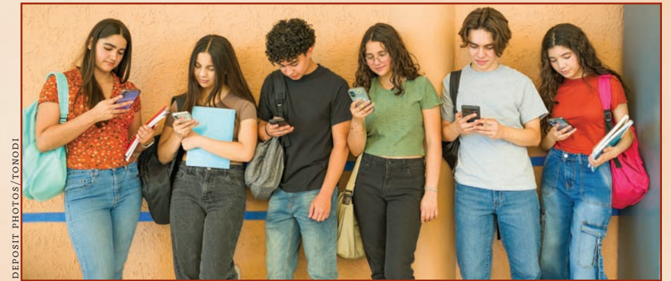
Wise use of digital devices has become a primary adjustment in families. Too often young ones, including young adults, spend more time in the virtual universe than in the real world developing important skills and relationships.

The book stresses that parents must examine their own device habits, because