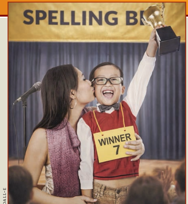
Success is important, but it must be achieved in the right way. Forcing kids to achieve important goals is counter to Positive Discipline. Parents do better when they enlist their children's inspiration and do not foist their own goals on them. When children achieve on their own, success feels genuine, satisfying and freely earned.